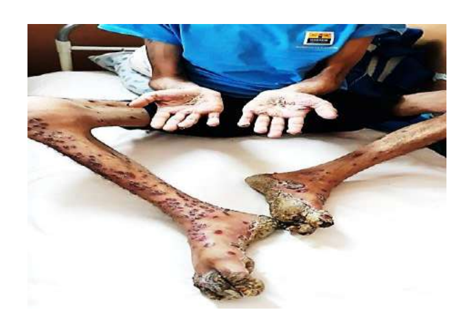
Fig 5 Bulk items on lower extremities