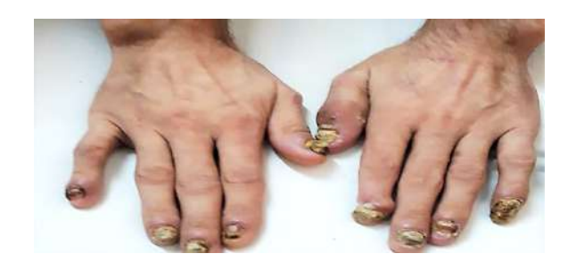
Fig1 Candidas of arms