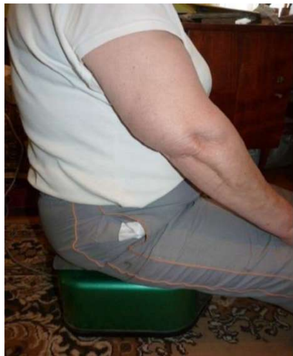
Figure 2: A patient sitting on the rubber platform of the automatic massager.

The personal blood pressure monitor Rossmax MS60 (Taipei, Taiwan) was used for pressure measurements. The arm cuffs were positioned approximately at 2 cm above the left hand elbow. In order to increase the accuracy of measurements of blood pressure before vibratory massage session, the pressure was measured twice with interval of 2 min. The last was necessary to restore blood circulation in hand before the first measurement. After two consecutive measurements, the obtained results were averaged. Patients had rested on