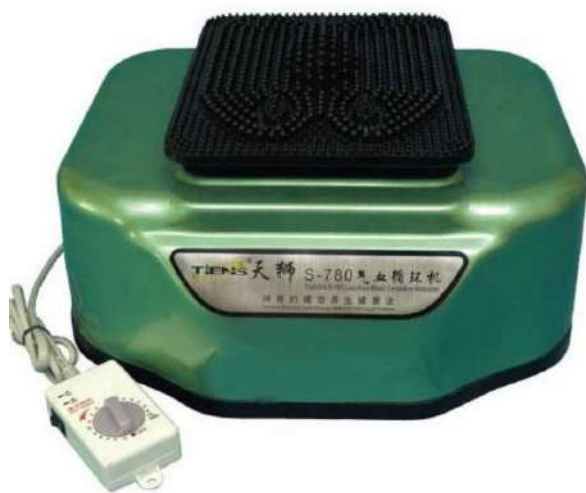
Figure 1: The apparatus for periodic mechanical vibrations with a timer and a rubber platform.

Using a mechanical vibratory massage at the wellness centers confirms the general action of this apparatus. In practice, it is used in case of health problems with the musculoskeletal system, arthritis, varicose veins, chronic fatigue, insomnia, joints pain, and digestive disorders. Duration of vibration massage is controlled by a built-in timer. The central vibrating platform generates vibrations in two planes with amplitude of approximately 6 mm. The frequency of vibrations is fixed and equal to 720 vibrations per min.