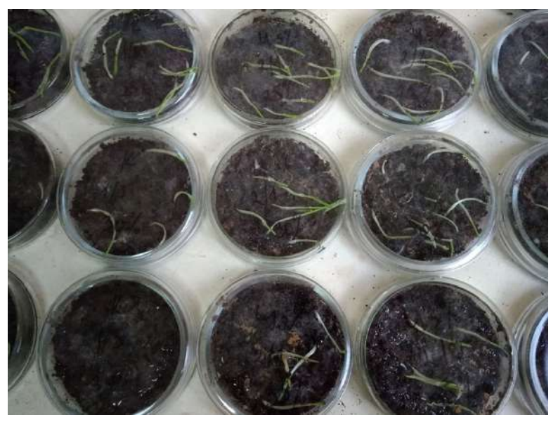
Figure 3 General view of bioindicators planted in the investigated substrates (see online version for colours)

According to the results of previous studies, a maximum of 40% of sludge was added to this substrate and ordinary barley ( Hordeum vulgare ) was used as a bioindicator.