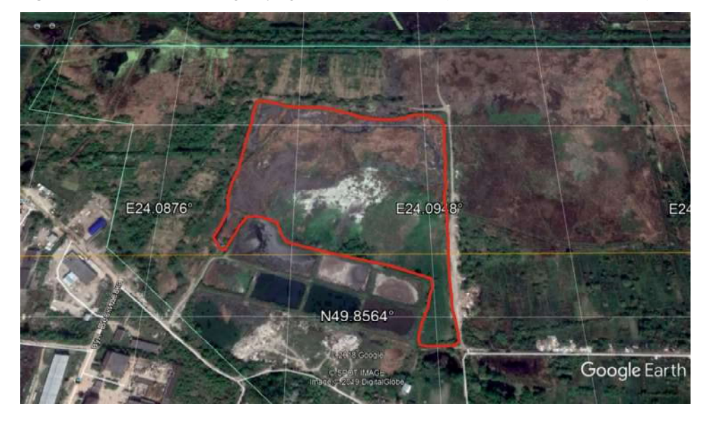
Figure 1 Location of the sludge drying beds at Lviv WWTP (see online version for colours)

The qualitative indices of sewage sludge were determined according to usual procedures in the laboratory of agrochemical, toxicological and radiological studies of soil ecological safety and product quality of the Lviv Branch of the public institution 'Derggruntokhorona'. The main indices were: humidity, pH, organic matter content, basic biogenic elements (phosphorus, potassium, nitrogen), as well as trace elements and heavy metals.