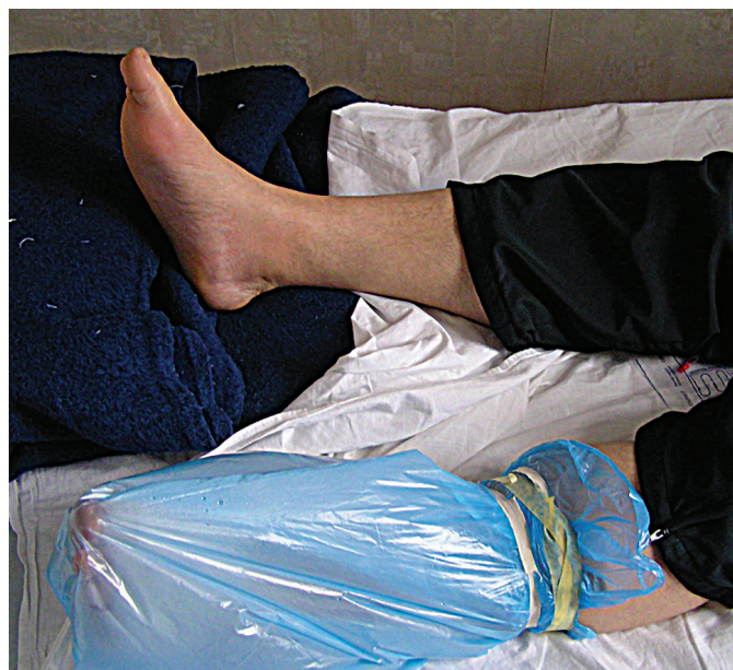
Fig. №1. Application of "ozone boot" in patients with ischemic-gangrenous form of DFS

The gas concentration in a formed closed space was 15 – 40 mcg/ml. Duration of ozone therapy was 45 minutes, it was performed every day in combination with intra-arterial injection of ozone physiological saline (OPS) in the dose of 200 ml. Infusion was given by means of an infusomat or specially designed for this procedure rack.