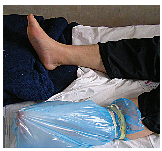
Fig. №1. Application of "ozone boot" in patients with ischemic-gangrenous form of DFS

The gas concentration in a formed closed space was 15-40 mcg/ml. Duration of ozone therapy was 45 minutes, it was performed every day in combination with intra-arterial injection of ozone physiological saline (OPS) in the dose of 200 ml. Infusion was given by means of an infusomat or specially designed for this procedure rack.